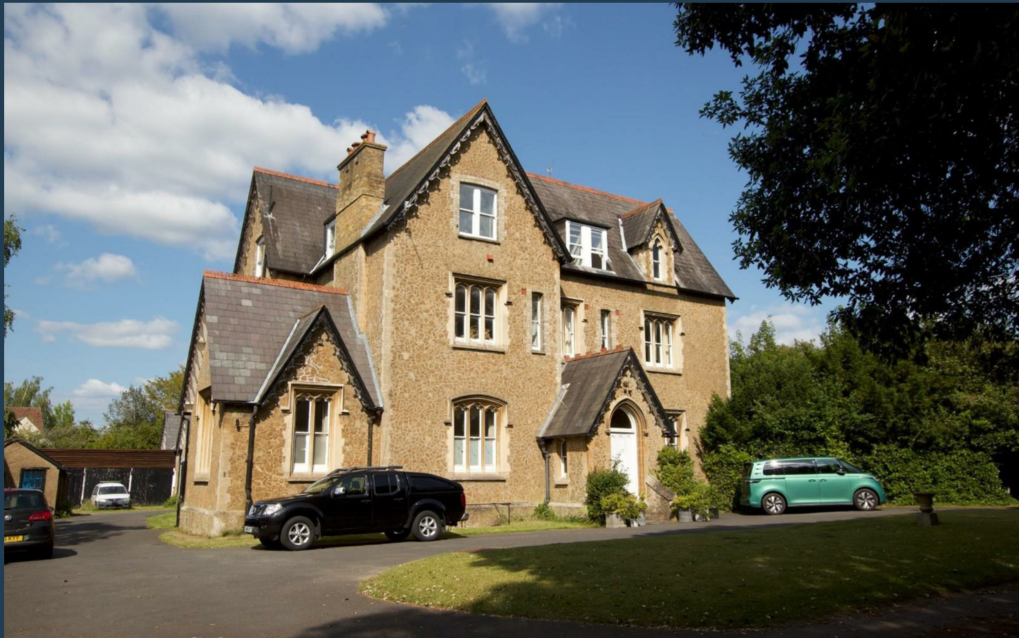
Glebe House Cross Lanes, Guildford GU1 1SX